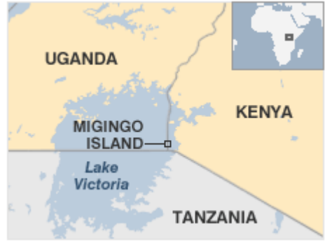
About Lake Victoria: